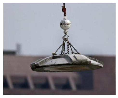
A large mounted crane lifted the cap from the tower.

The process requires removing the blocks "in a careful